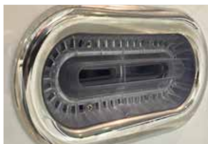
HIGH POWERED RIVER JETS