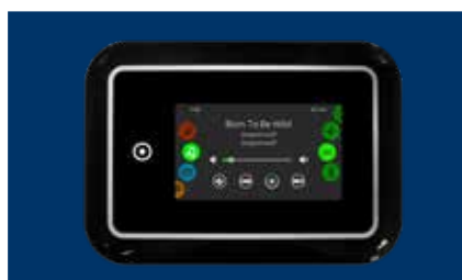
USER FRIENDLY, DIGITAL CONTROLS