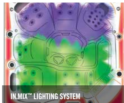
IN.MIX™ LIGHTING SYSTEM