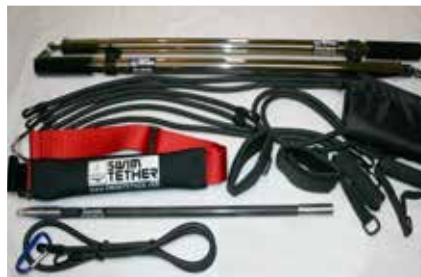
AQUATIC EXERCISE EQUIPMENT